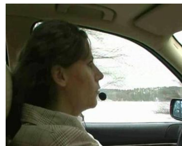
The Personal DJ running as a pilot in a BMW.

Dialogue Technologies' Ergo platform translates commands and queries in natural language to database queries – e.g. selecting the music to play. The resulting applications have no hierarchy – you can ask any question in any order. You can supply as much information as you want – Play 'White Christmas' by 'Irving Berlin' sung by 'Bing Crosby' – or as little information as you want – Play 'White Christmas.' In case the Personal DJ finds many alternatives an intelligent dialogue is launched to help the user find exactly what he/she is looking for. Can the requested song not be found a set of help features assists the user.