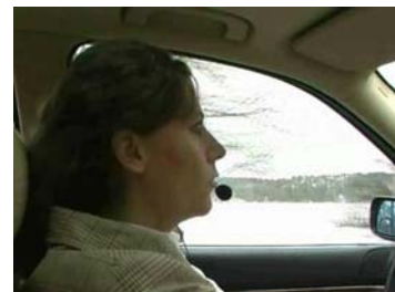
The Personal DJ running as a pilot in a BMW.

Dialogue Technologies' Ergo platform translates commands and queries in natural language to database queries – e.g. selecting the music to play. The resulting applications have no hierarchy – you can ask any question in any order. You can supply as much information as you want – Play 'White Christmas' by 'Irving Berlin' sung by 'Bing Crosby' – or as little information as you want – Play 'White Christmas.' In case the Personal DJ finds many alternatives an intelligent dialogue is launched to help the user find exactly what he/she is looking for. Can the requested song not be found a set of help features assists the user.